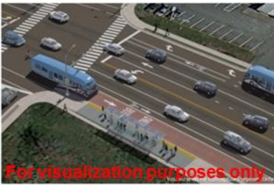
For visualization purposes only