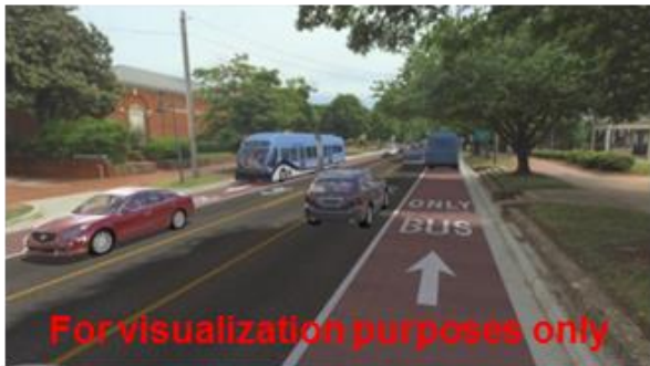
For visualization purposes only