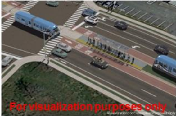
For visualization purposes only